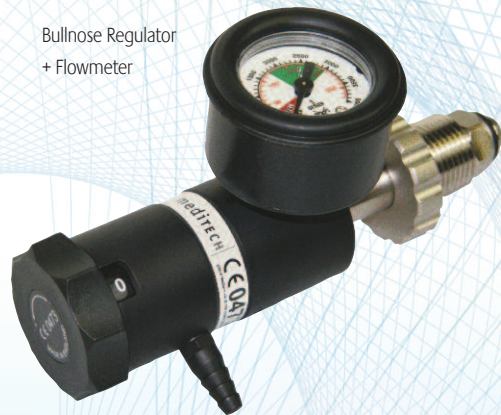
Bullnose Regulator + Flowmeter