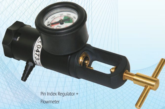
Pin Index Regulator + Flowmeter